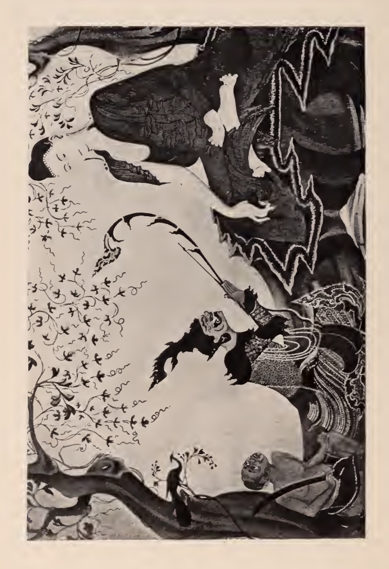
BURMESE FRESCO REPRESENTING THE BUDDHA WORSHIPED BY A FOREST SATYR AND HIS ATTENDANT.